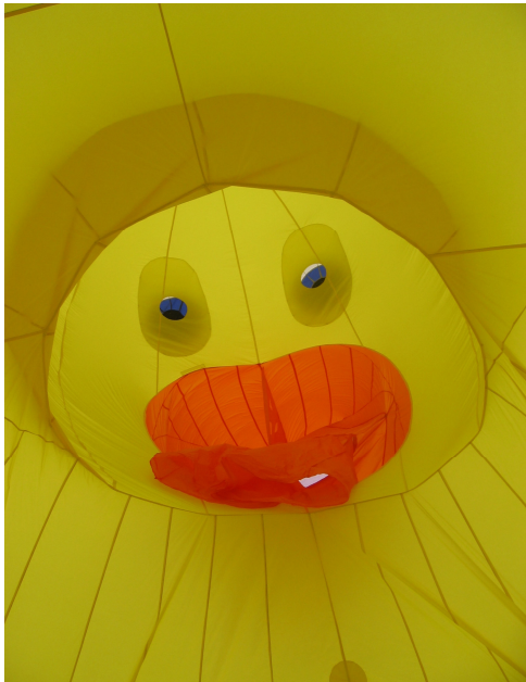
A view from inside “What the Duck”